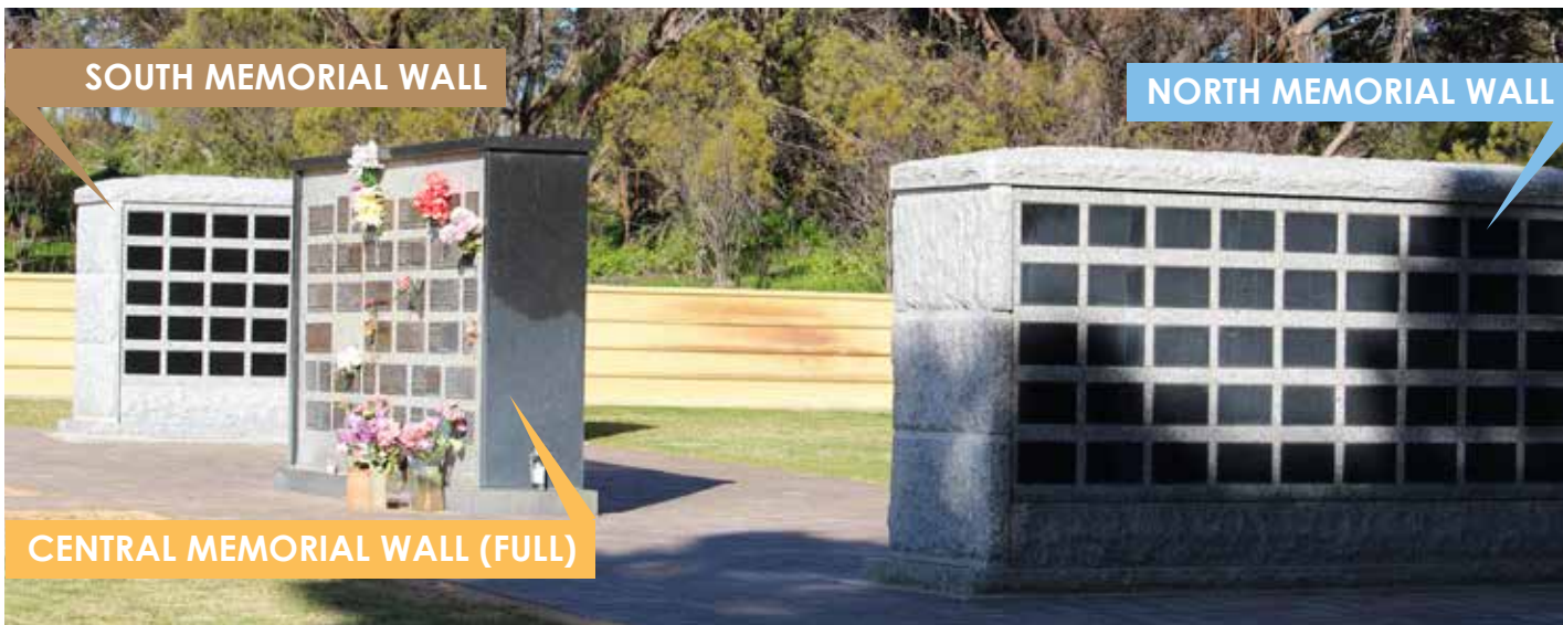
SOUTH MEMORIAL WALL